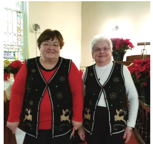
THE TWO MARY'S THINK ALIKE! ( Wore Same Sweaters Vests)