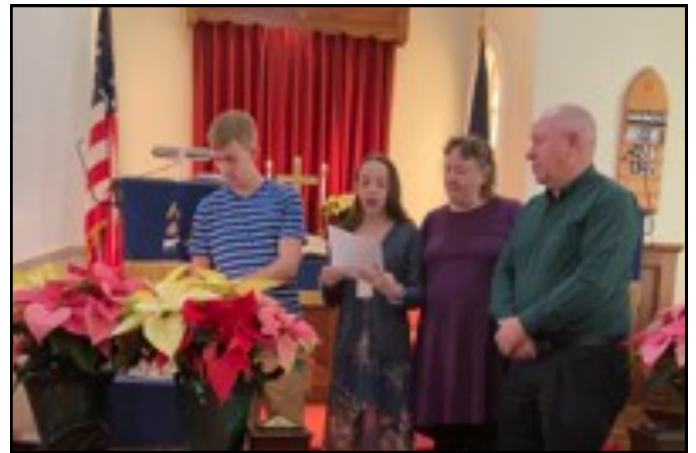
THIRD ADVENT CANDLE - JOY THE SUNDAY FAMILY