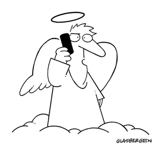
"I don't know how you got my number up here, but I do not need any afterlife insurance!"

Church services were cancelled January 31 and February 7 due to inclement weather.