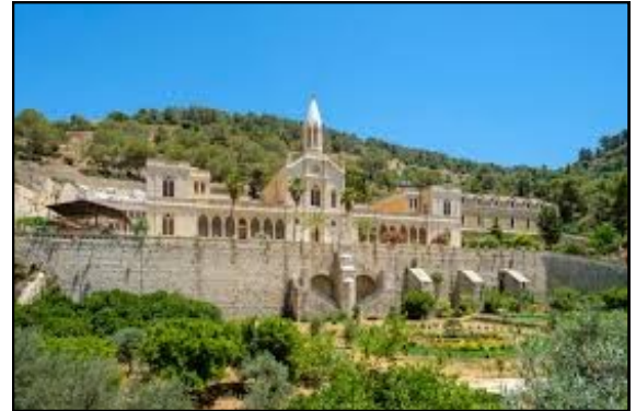
Nabi Yahya Mosque

The burial-place of John the Baptist was traditionally said to be at the Nabi Yahya Mosque (Saint John the Baptist Mosque) in Sebastia in current Palestinian territories, and mention is made of his relics being honored there around the middle of the 4th century.